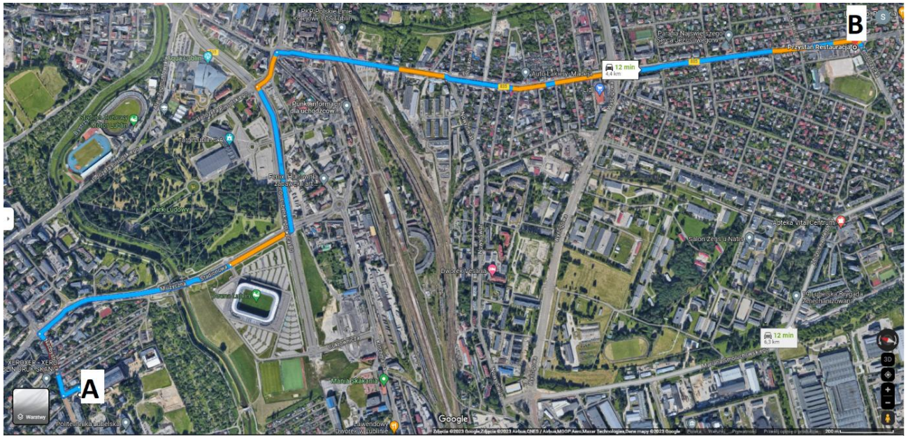
A: Lublin, Nadbystrzycka 36